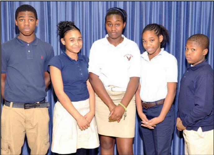
Hope Academy student participants.