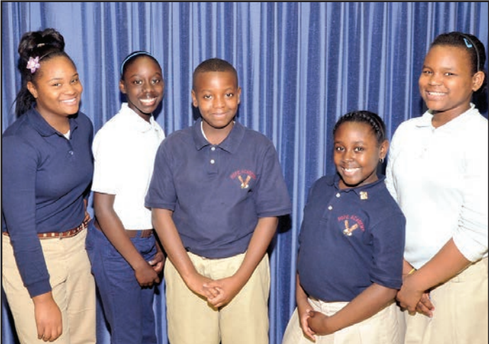
Hope Academy student participants.