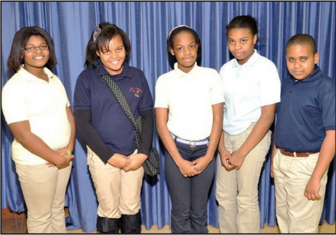
Hope Academy student participants.