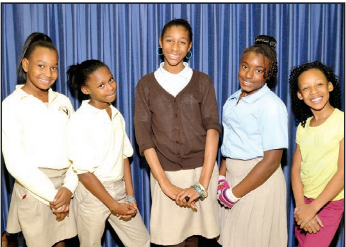
Hope Academy student participants.