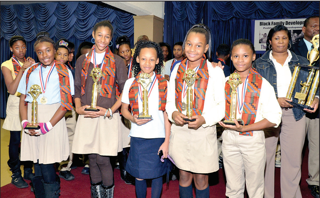
Hope Academy first place champions.