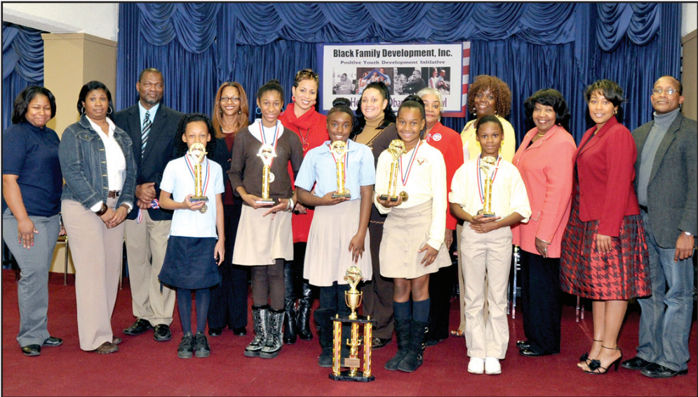
Hope Academy student champions with Hope Academy staff, judges for the competition, and event participants.