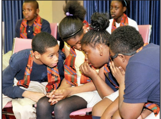
Hope Academy student participants.